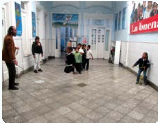
Children playing at a Guadalajara children's center.

Most socios indicate that they have relatives watch their children when they are at work, whereas most promoters choose to work hours around their children's school schedule. However, PH could consider partnering with a community center to provide a location for socios', promoters' and staffs' children to come to after school, while their parents are at work. At the center, children could receive assistance with their homework, have access to a computer, and/or learn the value of teamwork through athletics. Community centers also frequently provide healthy snacks for children, contributing to improved nutrition.