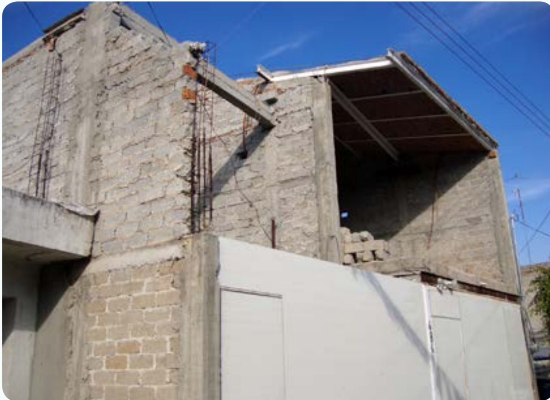
A socio's home under construction.

present it the following week to the other promoters. As a result of these workshops, promoters improve their communications skills. These workshops are especially important in Guadalajara's machista culture. vi In fact, PH found that 37.8% of promoters said they faced problems with their partner because of their independent work outside the home. 61 Promoters also develop their communications skills through sessions that focus on the family. Violence at home is often reduced as a result of these family workshops. 62 Children appear to feel the reduced tension at home when a strong mother begins advocating for her rights and the rights of her children. One promoter told us that before she began working with PH, she was depressed and was only living for her children. She was afraid of her husband, but once she joined PH, she lost that fear, and took control of her life. PH found that this promoter was not alone. A PH survey found that 93.6% of promoters said they were able to transfer what they learned during the PH trainings into other areas of their lives. 63