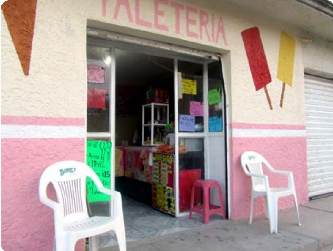
This ice cream shop is the first room one socio built. The room is now being rented out as an ice cream store front.

Table 3 summarizes direct and indirect impacts on the children of all PH's stakeholders that we observed on our field visit. Impacts in bold font are explored in detail in the next section, while details of non-bolded impacts can be found in Appendices B-F .