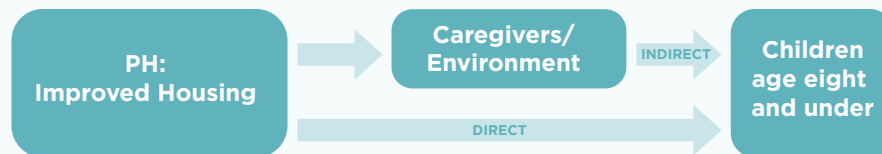
Figure 3: Direct and Indirect Impacts on Children

The customized set of potential impacts we explored across the BoP IAF's three areas of well-being: