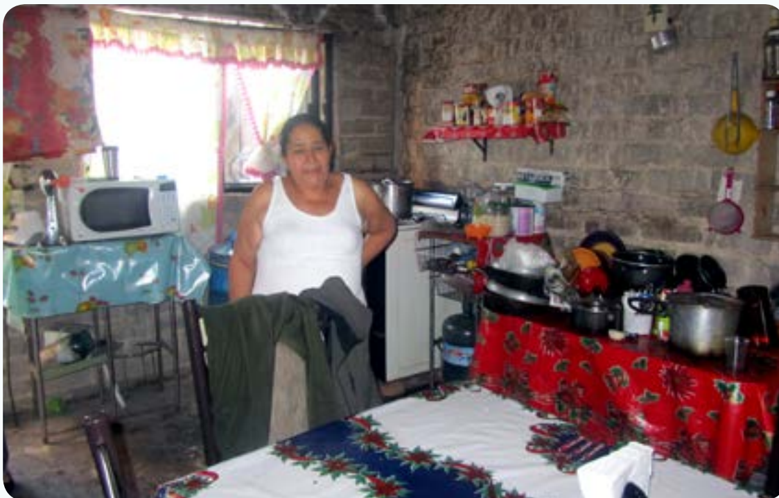
A socio in the kitchen she built through PH; she is saving to plaster the walls and tile the floor.

and retention within a specified zone. Promoters receive payment for every new socio they sign up, and for every week the socios remain enrolled in the program. Each promoter makes a weekly commitment to his or her personal attraction and retention objectives in collaboration with a sales leader and coordinator.