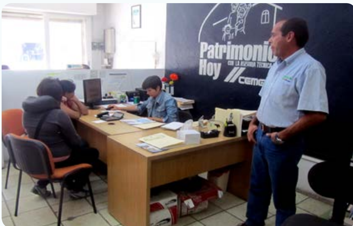
Technical advisor meeting with a socio in a PH cell.

Some low-income customers join savings clubs called “tandas” to finance their home construction. The clubs typically consist of approximately 10 members, each of whom pays into a savings pool. At the end of the week, one member, if it is his or her turn to collect, receives the entire sum of the savings from the pool. Only 10% of tanda members actually complete their building projects, with most reporting quitting when resources must be redirected to necessities or emergencies. 6