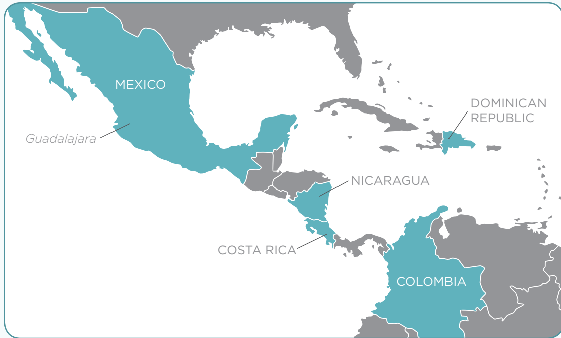
Figure 1: Patrimonio Hoy Areas of Operations

● Indicates countries where PH is located.