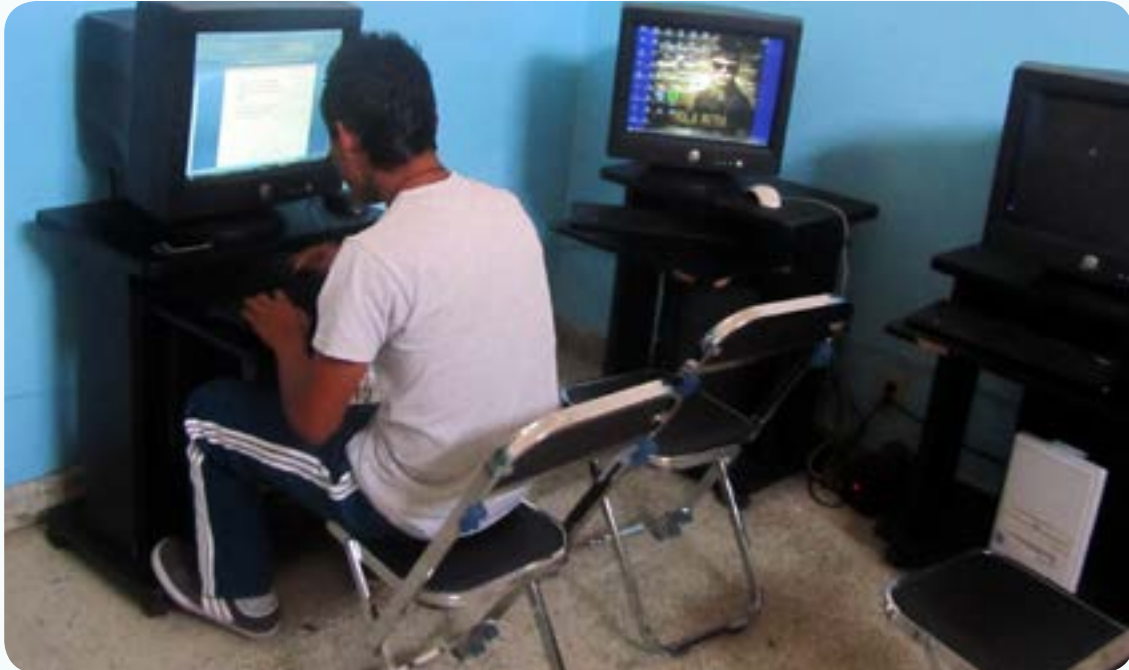
A child doing schoolwork at a Guadalajara children's center.