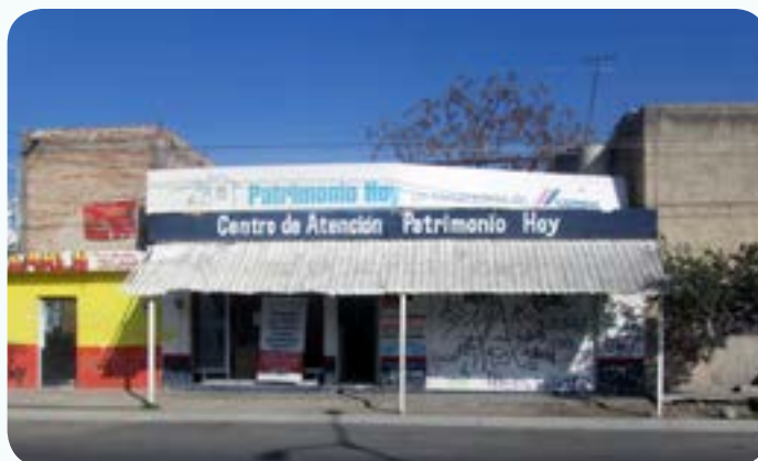
A PH cell (office) in Zalaitan, Guadalajara.

The experiences of the youngest children in the 0-5 age group differ from those of older children. Impacts on the youngest children are most likely related to their health as a result of general improvements in the home environment as well as possible changes in their nutrition during the saving process. Older children (ages 6-8) are likely to experience additional impacts resulting from increased privacy and gaining space to study.