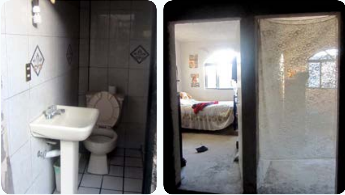
A bathroom and two bedrooms built through Patrimonio Hoy.

When families rent, they frequently share a bathroom outside the home with others. Once the bathroom moves inside the home, there are improvements to children's health. 35 The impact is even more significant for families that go to the bathroom on open land. Children many times accidentally dig up these holes when playing outside. 36 The incidence of diarrhea, for example, is reduced, as are parasitic diseases, E. coli, and other bacterial infections, when contact with human or animal waste is reduced or mitigated.