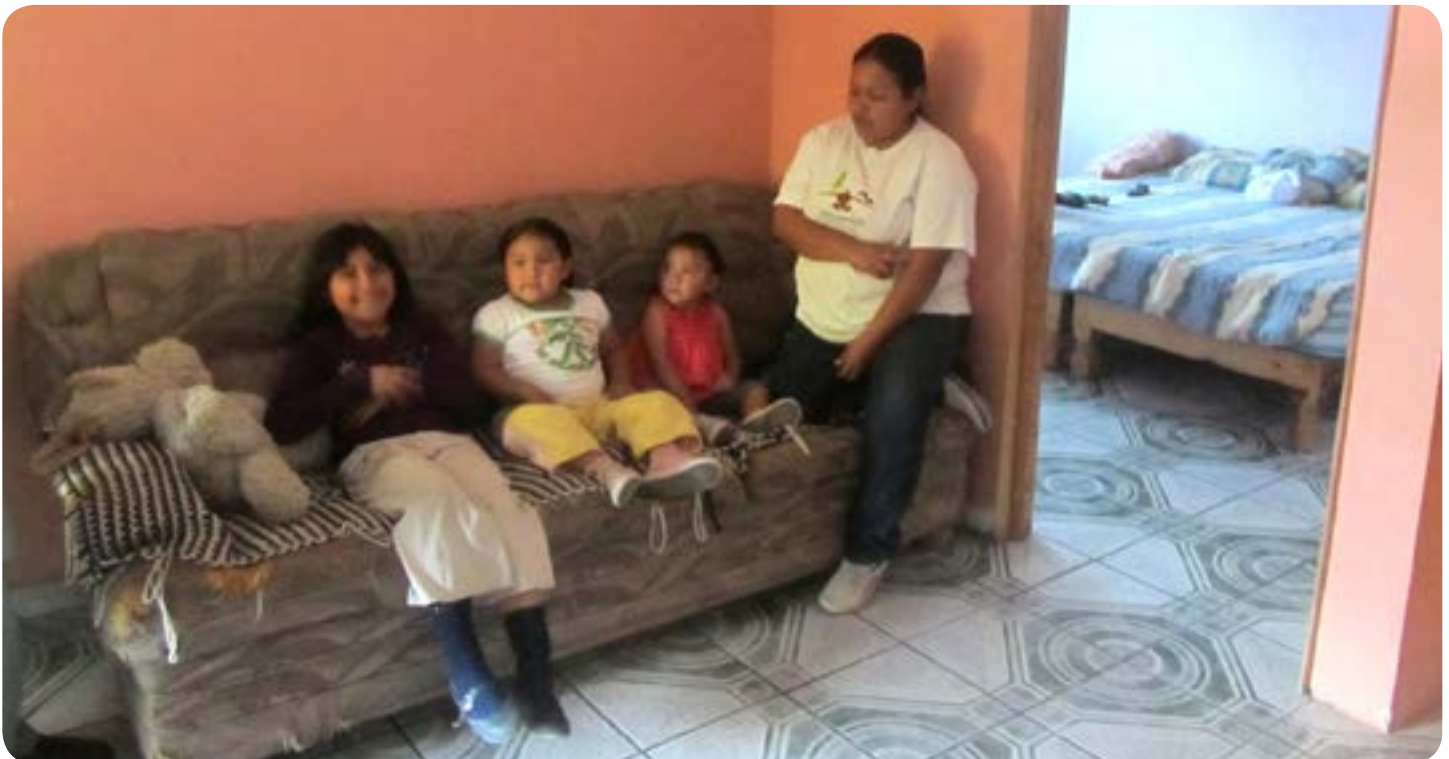
Promoters home built through PH.