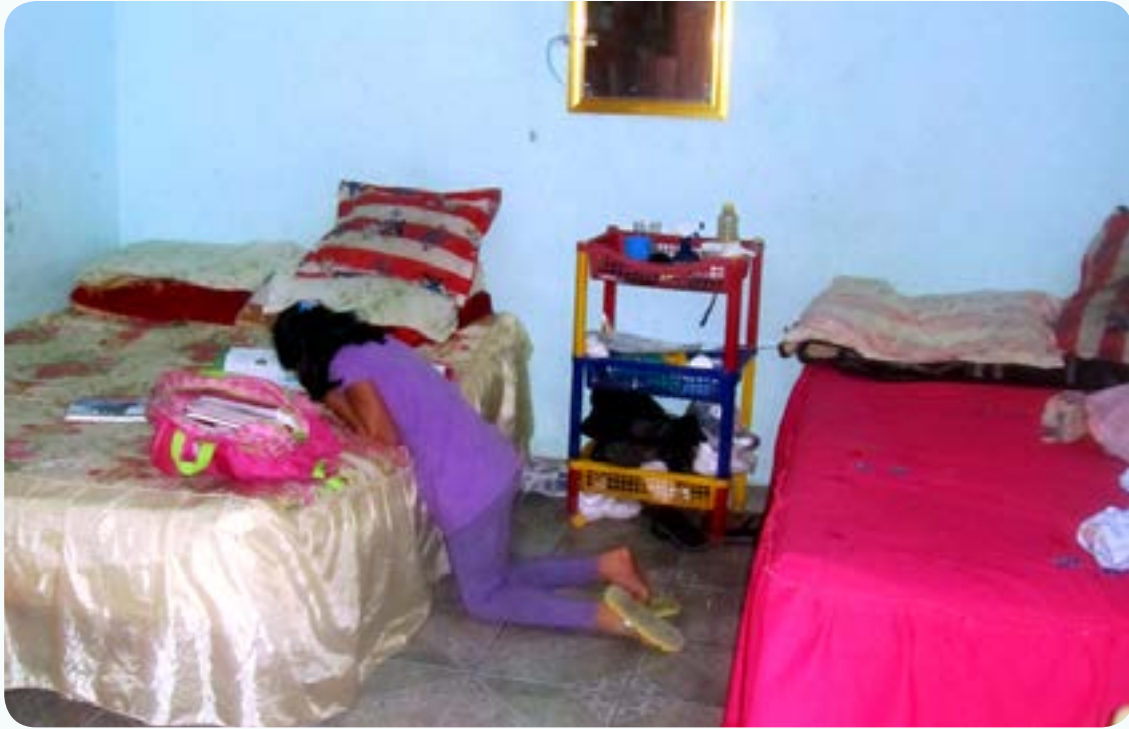
A socio's granddaughter studying in her bedroom.

seems that when socios add rooms to their homes, the new space also attracts more people who want to spend time there or even live there. This allows close relationships to develop that may not have existed otherwise. One of the socios we met watches her grandchildren during the day at her house, something she could not have done before she added rooms to her home with PH. 50 As a result, she has better relationships with her grandchildren. Another PH client now has her granddaughter living with her. 51