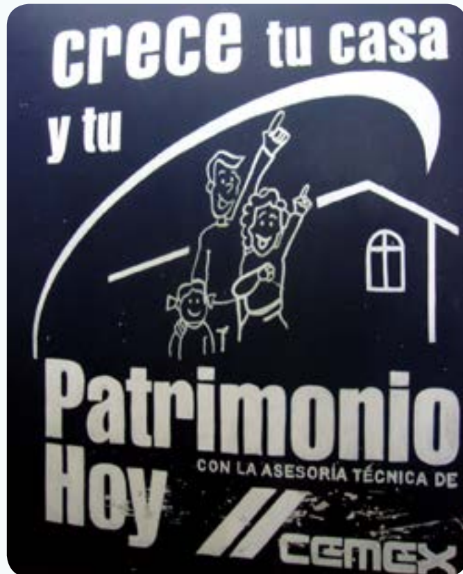
A PH advertisement outside a PH cell in Guadalajara.

CEMEX launched PH in 1998 to reach these consumers. The initiative, which functions as an autonomous unit of CEMEX, has generated some $50 million in revenue and has received a number of awards and accolades, including the UN Programme's 2006 World Business Award in support of the UN Millennium Development Goals and the 2009 UN Habitat Award for Best Practices in Affordable Housing Solutions.