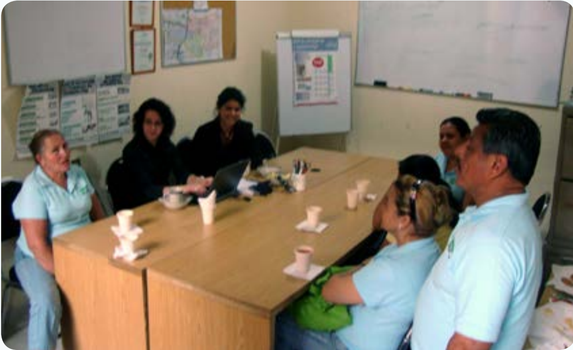
A focus group with promoters at a PH cell.

anything else related to this topic that you haven't shared with us yet?" This encouraged interviewees (see Table 2 for a list of respondents) to share additional information. We also incorporated insights from earlier interviews in later interviews to develop a more refined understanding of impacts. Each interviewee received a small thank you gift for their time. v